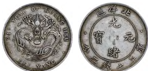
31117 (t) CHINA. Chihli (Pei Yang). 7 Mace 2 Candareens (Dollar), Year 34 (1908). Tientsin Mint. Kuang-hsu (Guangxu). PCGS EF-40. L&M-465; cf. K-208 (for type); KM-Y-73.2; WS-0642. Frozen date issue with plain 4. Featuring a deeper tone nearer the peripheries, this wholesome survivor presents a mostly lighter gray hue otherwise.

北洋三十四年造光緒元寶七錢二分銀幣。固定日期，普通4。邊緣處包漿更加濃厚，其餘部位則多呈淺灰色澤。