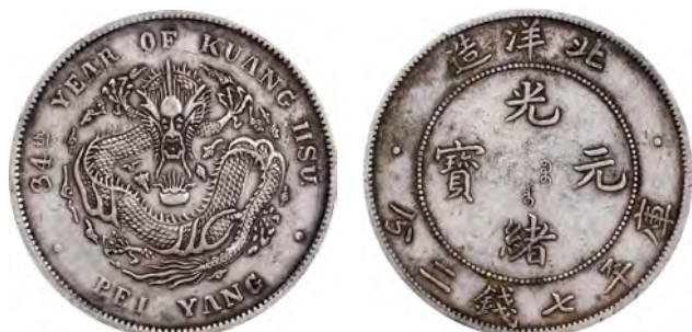
31116 (t) CHINA. Chihli (Pei Yang). 7 Mace 2 Candareens (Dollar), Year 34 (1908). Tientsin Mint. Kuang-hsu (Guangxu). PCGS EF-40. L&M-465; cf. K-208 (for type); KM-Y-73.2; WS-0642. Frozen date issue with plain 4. Employing a deep gunmetal gray hue, this wholesome survivor has a great two-toned nature, with some deeper color highlighting the devices.

北洋三十四年造光緒元寶七錢二分銀幣。日期不變，普通4。深槍灰色包漿，圖文間某些色澤更為深邃，兩色相融。