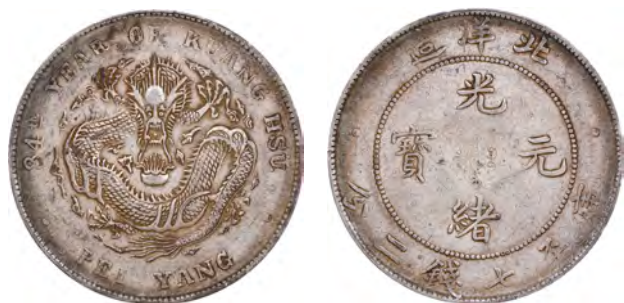
31114 (t) CHINA. Chihli (Pei Yang). 7 Mace 2 Candareens (Dollar), Year 34 (1908). Tientsin Mint. Kuang-hsu (Guangxu). PCGS EF-40. L&M-465; cf. K-208 (for type); KM-Y-73.2; WS-0642. Frozen date issue with plain 4. This original “Dragon Dollar” from the waning years of production for the type features an amber-gray hue and some darker notes near portions of the peripheries.

北洋三十四年造光緒元寶七錢二分銀幣。日期不變，普通4。琥珀灰色調，環形些許色澤更深。