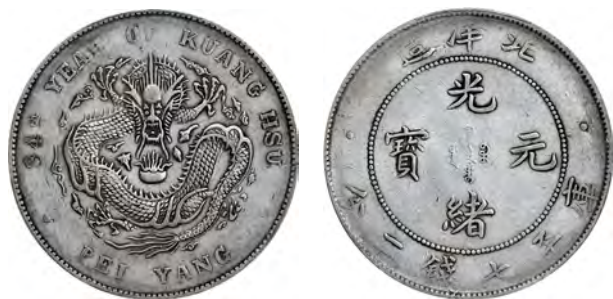
31115 (t) CHINA. Chihli (Pei Yang). 7 Mace 2 Candareens (Dollar), Year 34 (1908). Tientsin Mint. Kuang-hsu (Guangxu). PCGS EF-40. L&M-465; cf. K-208 (for type); KM-Y-73.2; WS-0642. Frozen date issue with plain 4. Sporting a pewter-gray tone with tinges of amber highlighting the devices, this evenly-handled survivor retains a charming overall appearance.

北洋三十四年造光緒元寶七錢二分銀幣。固定日期，普通4。呈白鑞色包漿，圖文間有絲絲琥珀色。經手痕跡均勻，整體品相俊美。