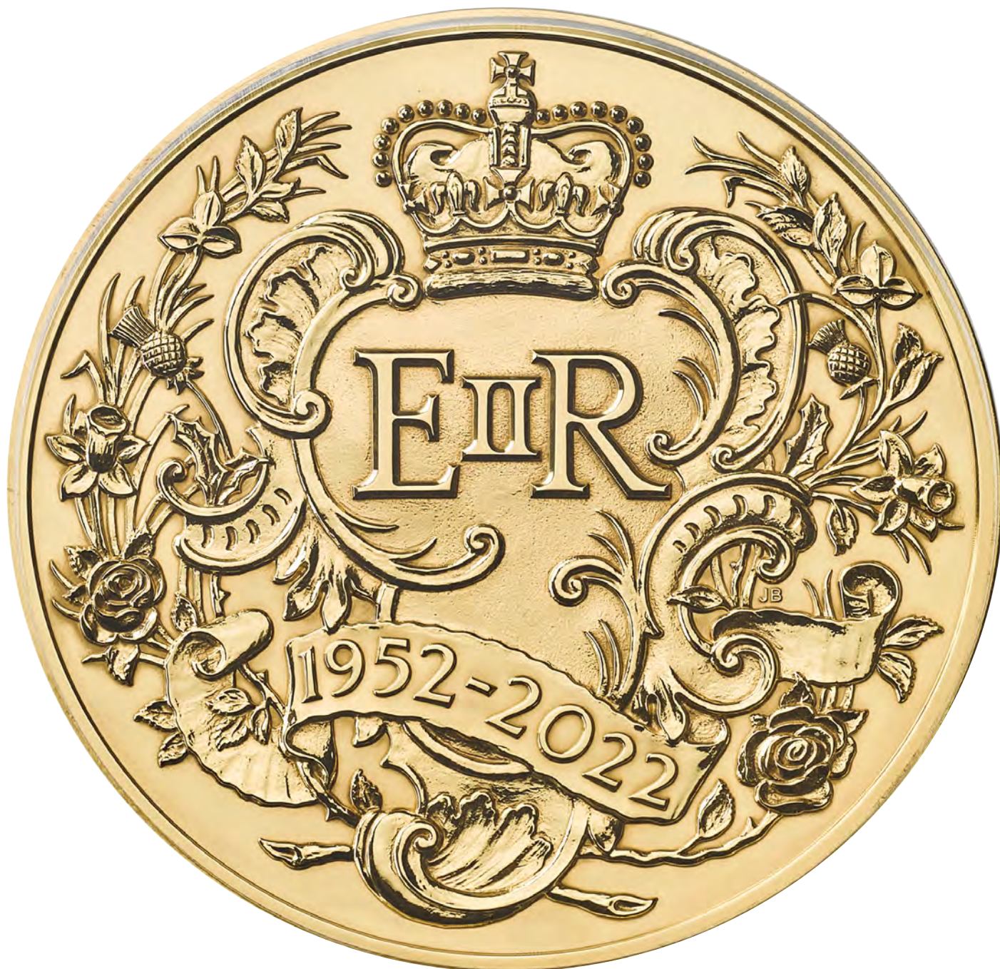
Reverse of Lot 52255