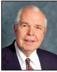
Q. David Bowers Stack's Bowers Galleries Founder QBowers@StacksBowers.com