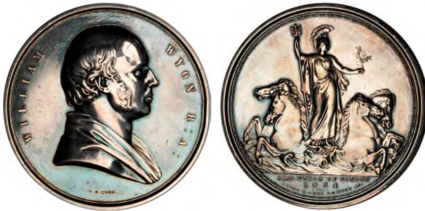
1854 silver medal featuring William Wyon, engraver of the Una and the Lion £5.