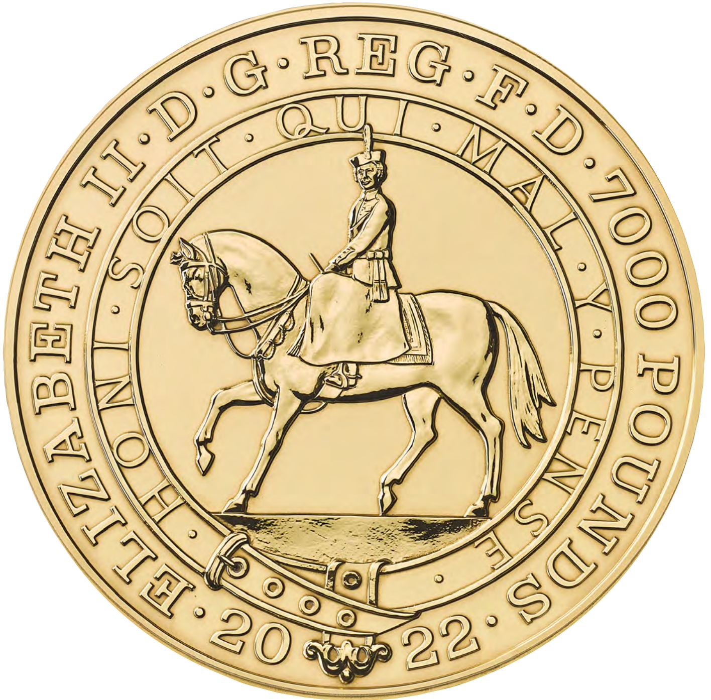
Obverse of Lot 52255