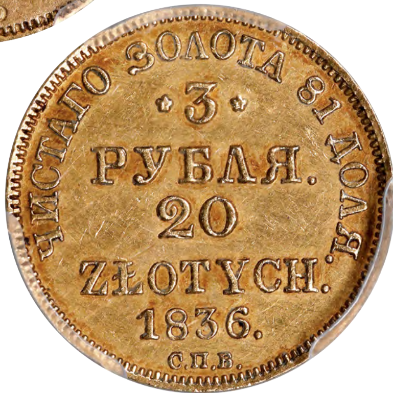
FIRST STRIKE MIRROR BROCKAGE — 20 ZLOTYCH (3 RUBLES), 1836-CNB. ST. PETERSBURG MINT. NICHOLAS I. PCGS AU-53.