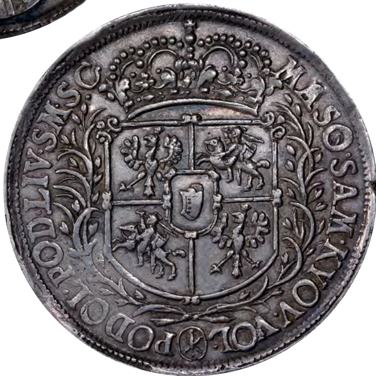
TALER, ND (1684)-SVP. BYDGOSZCZ MINT. JOHN III SOBIESKI. PCGS AU-58.