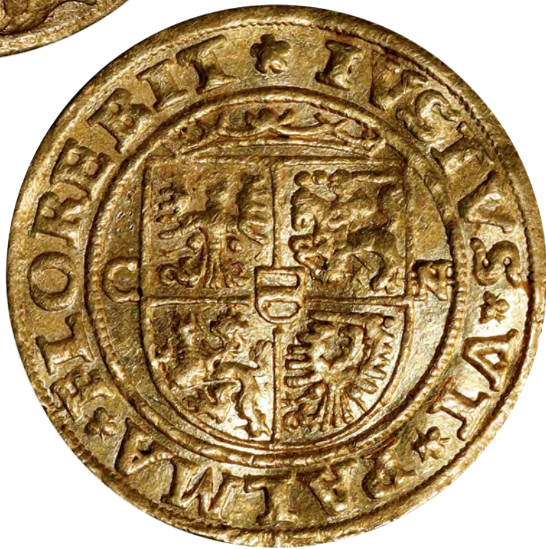
DUCAT, 1529-C N. KRAKOW MINT. SIGISMUND I. PCGS MS-61.