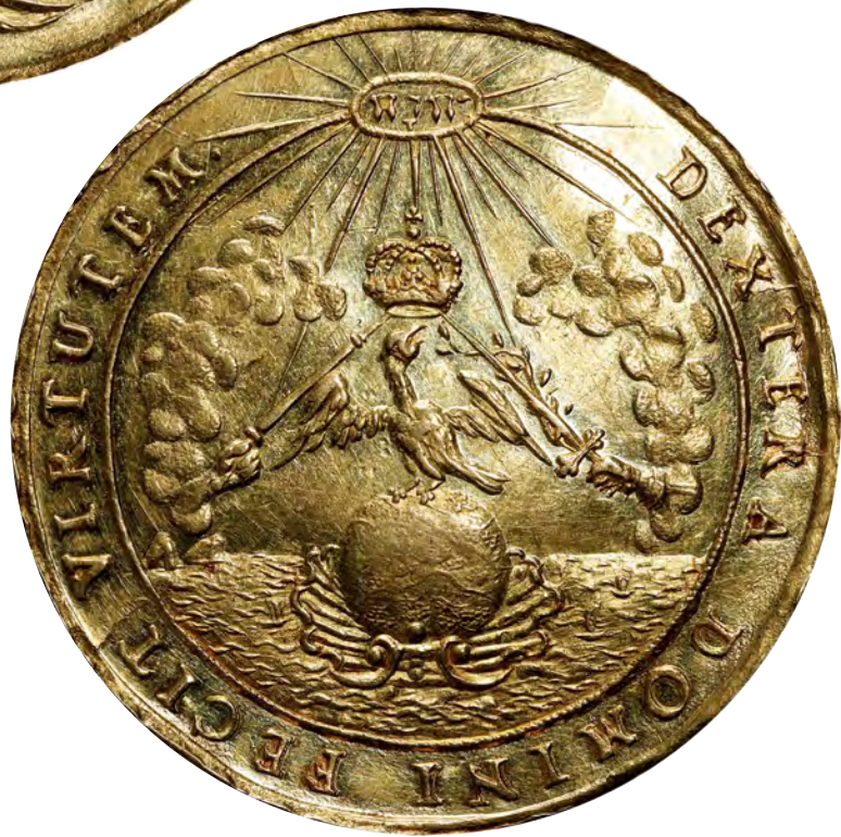
GOLD MEDALLIC 5 DUCATS, ND (1669). MICHAL KORYBUT. PCGS UNC. DETAILS.