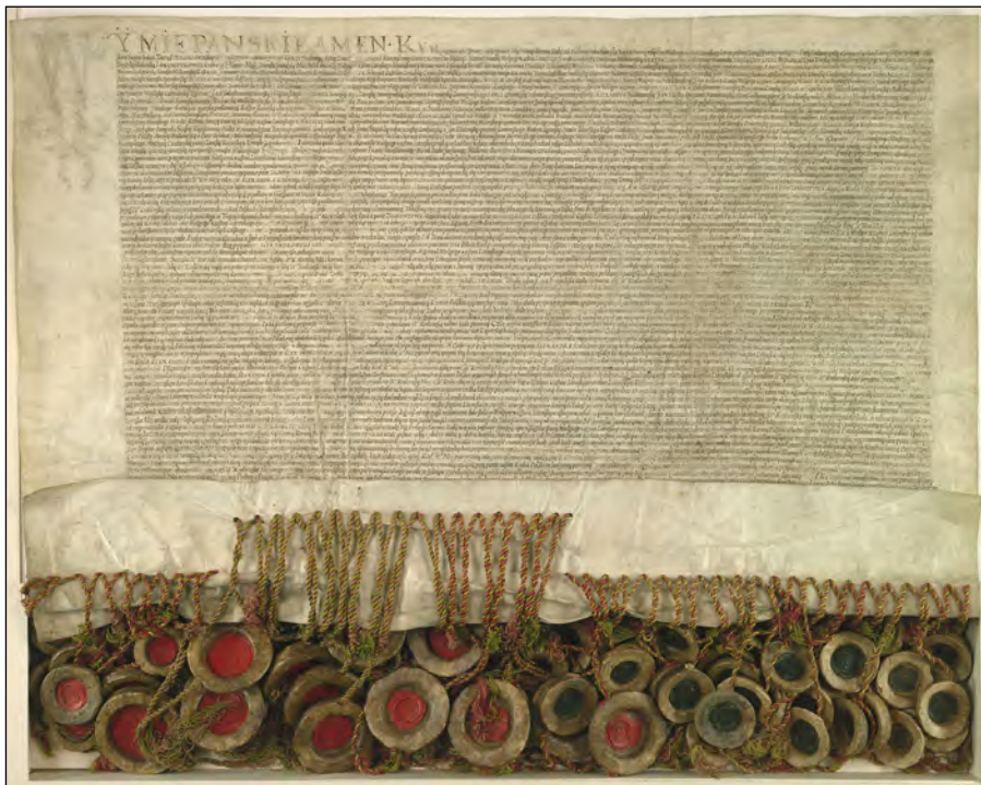
In 1569, the Union of Lublin joined the Kingdom of Poland and the Grand Duchy of Lithuania and established the Polish-Lithuanian Commonwealth.

The Polish-Lithuanian Commonwealth arguably reached its peak during the long reign of Sigismund III. A major force in Central and Eastern Europe, Sigismund III managed to unite Sweden and the Polish-Lithuanian Crown, if ever so briefly. In 1609, Poland occupied Moscow after invading during a period of civil war. In 1619 the Commonwealth reached its territorial zenith, and two years later the Poles inflicted a decisive defeat upon the Ottoman Turks at the Battle of Khotyn. After the reign of Sigismund III, the Commonwealth began to undergo a period of decline from both turmoil within and external pressure from years of warfare. In 1655 the Kingdom of Sweden, emboldened by gains in the Thirty Years War, invaded the Commonwealth in an event known as the “Deluge.” While it lasted only five years, this brief occupation had a tremendous long-term impact on the Commonwealth. Despite an important victory at Vienna in 1683 halting the Ottoman offensive in a conjoined effort with the Hapsburgs, the Commonwealth progressively shrunk in size and influence throughout the end of the 17th and the 18th centuries.