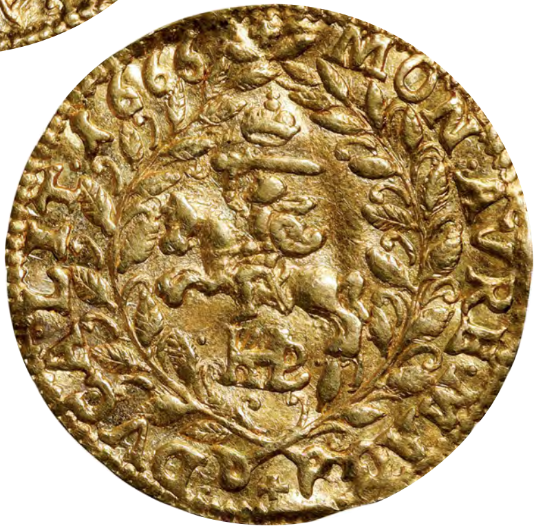
LITHUANIA. DUCAT, 1666-TLB HKPL. VILNIUS MINT. JOHN CASIMIR. PCGS AU-55.