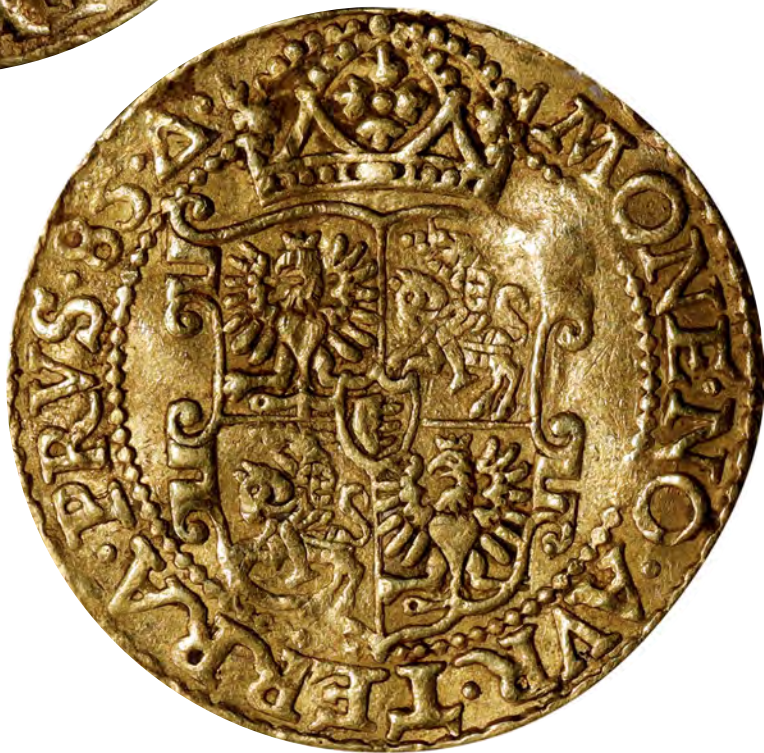
ROYAL PRUSSIA. DUCAT, (15)85. MALBORK MINT. STEPHAN BATHORI. PCGS AU-50.