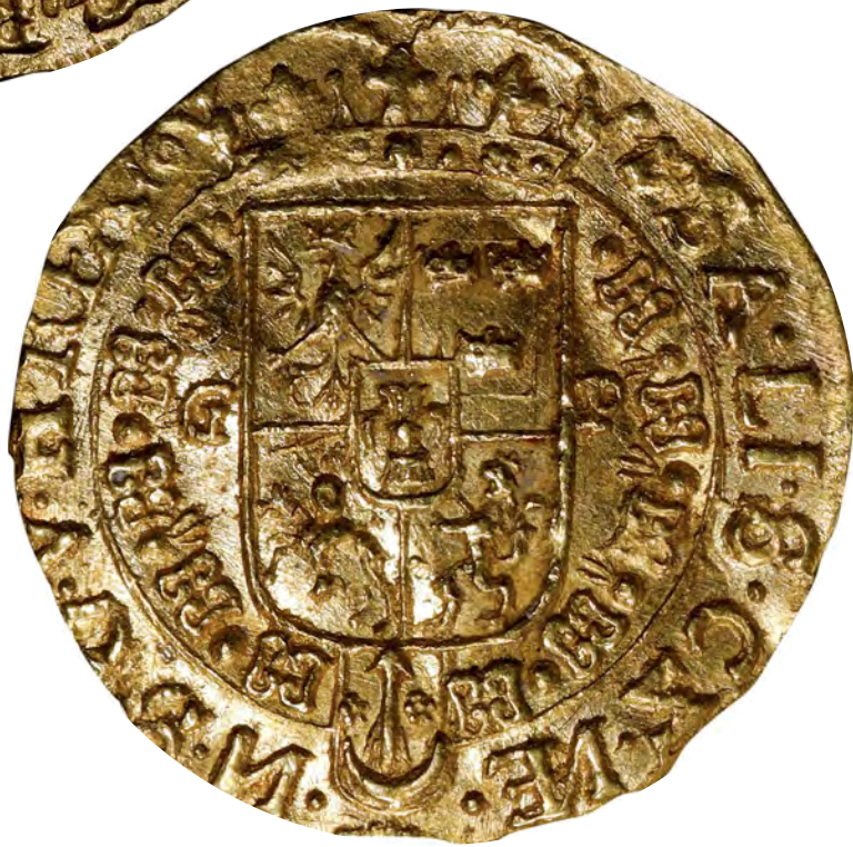
DUCAT, 1649-G P. KRAKOW MINT. JOHN CASIMIR. PCGS MS-62.