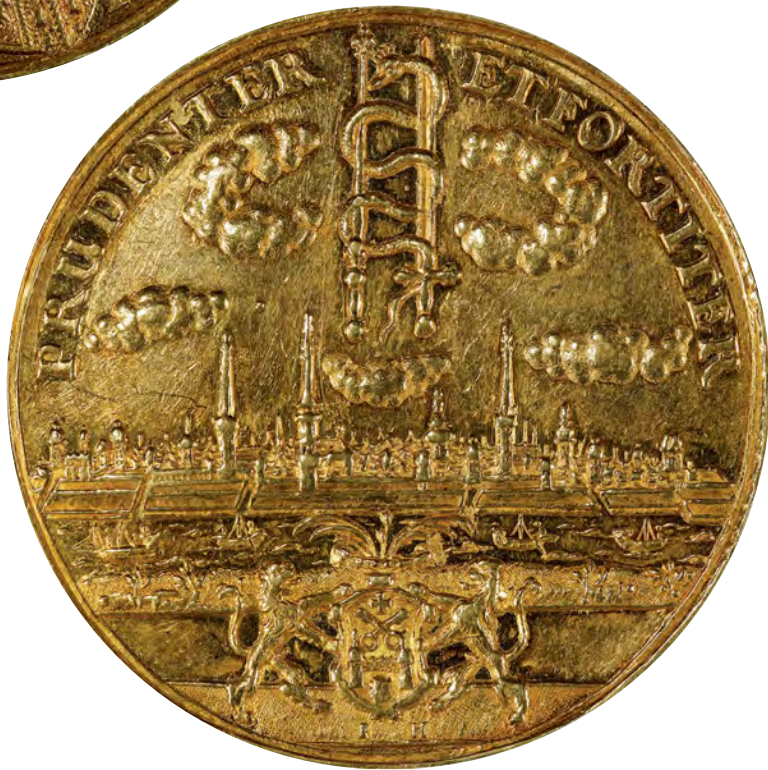
SWEDISH LIVONIA. GOLD MEDALLIC 10 DUCATS, ND (1655). RIGA MINT. KARL GUSTAV X. PCGS AU DETAILS.