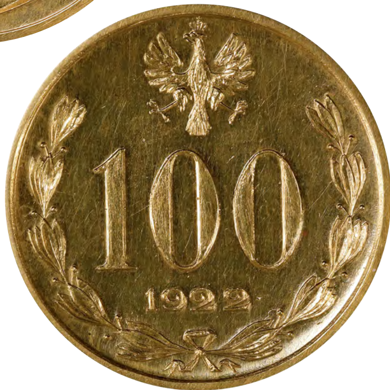
SECOND POLISH REPUBLIC. GOLD 100 MAREK PATTERN, 1922. WARSAW MINT. PCGS SPECIMEN-64.