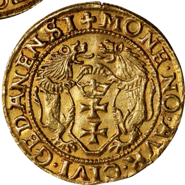
DANZIG. DUCAT, 1550. DANZIG MINT. SIGISMUND II AUGUSTUS. NGC MS-62.