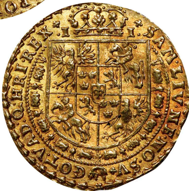
DUCAT, 1628-II. BYDGOSZCZ MINT. SIGISMUND III. PCGS MS-62.