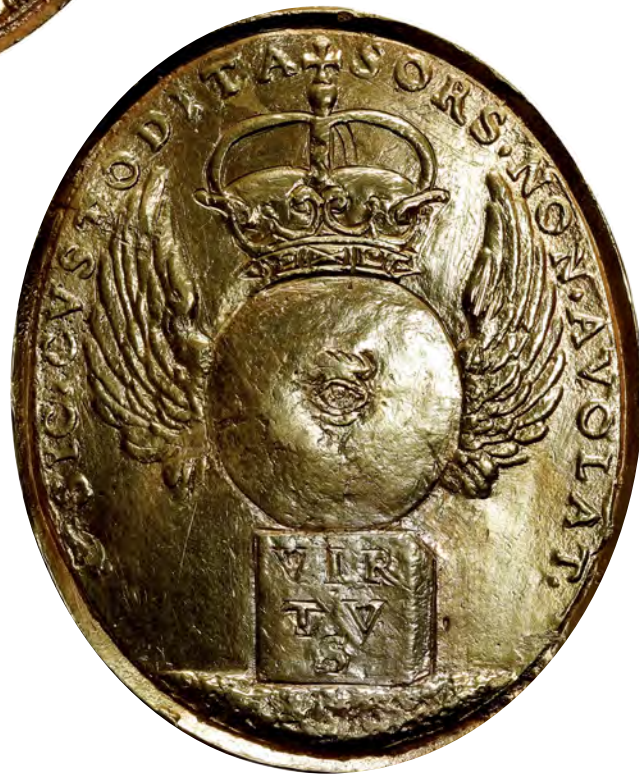
GOLD MEDALLIC 10 DUCATS, ND (1648-68). JOHN CASIMIR AS PRINCE. PCGS AU DETAILS.