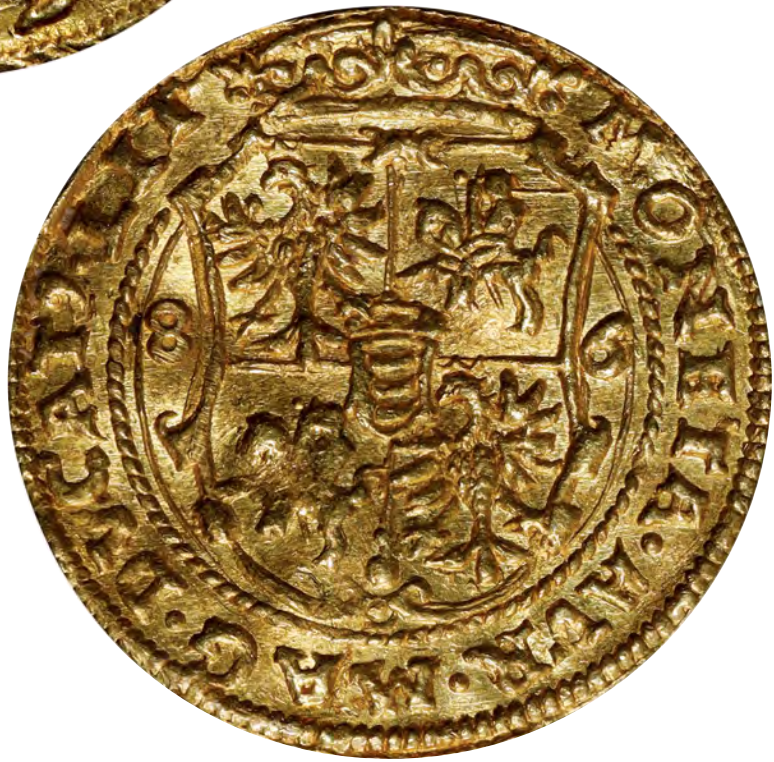
LITHUANIA. DUCAT, (15)86. VILNIUS MINT. STEPHAN BATHORI. PCGS MS-62.