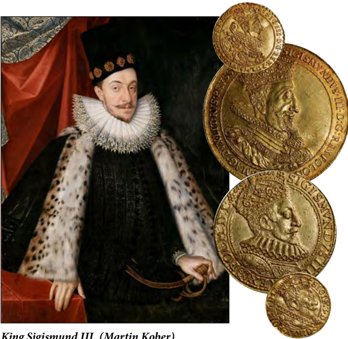
King Sigismund III. (Martin Kober)

In 1795, Russia, Austria, and Prussia, once subservient to the Commonwealth, partitioned the Commonwealth subsuming the Commonwealth under foreign rule for over a century. During the 19th century several ultimately unsuccessful attempts at reestablishing an independent Poland arose, starting with the Dutchy of Warsaw that was set up by Napoleon. In the 1848 European Revolutions, attempts to reestablish an independent Poland failed, along with many of the other liberal reformers of the time. It was not until the end of the First World War that Poland and Lithuania regained independence from external occupation.