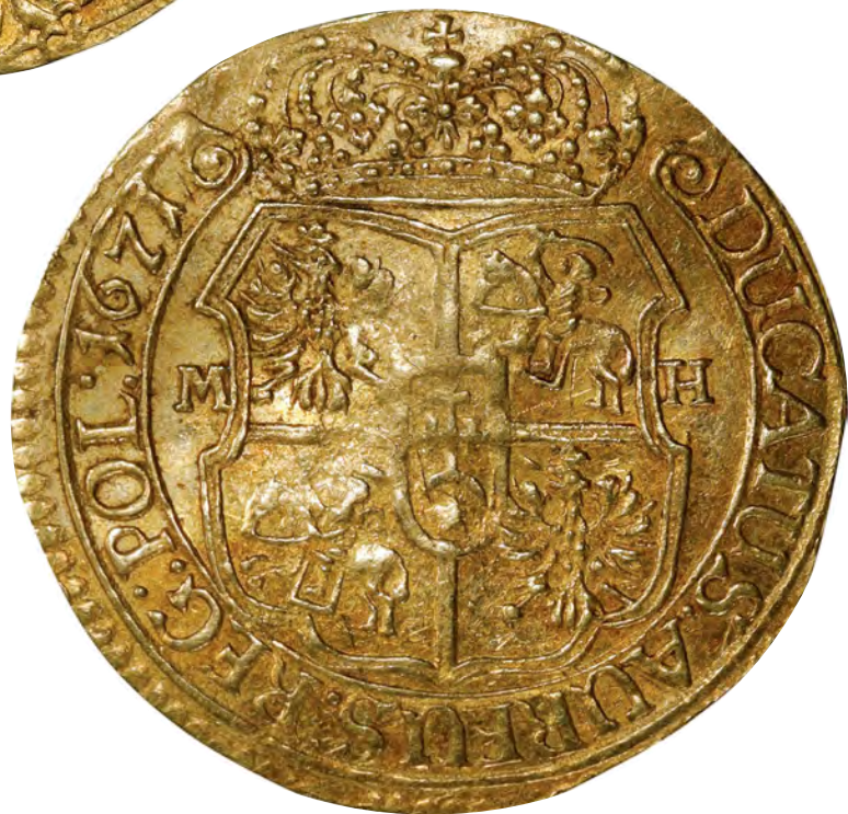
DUCAT, 1671-M H. MICHAL KORYBUT. PCGS AU-58.