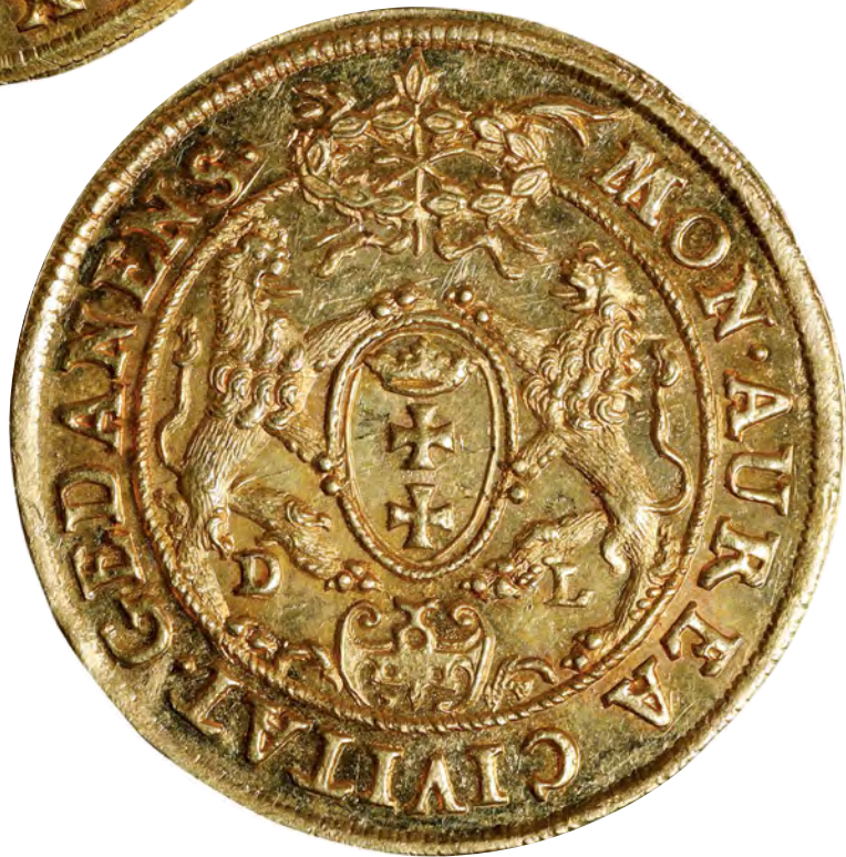
DANZIG. 2 DUCATS, ND (1694)-D L. DANZIG MINT. JOHN III SOBIESKI. PCGS MS-63.