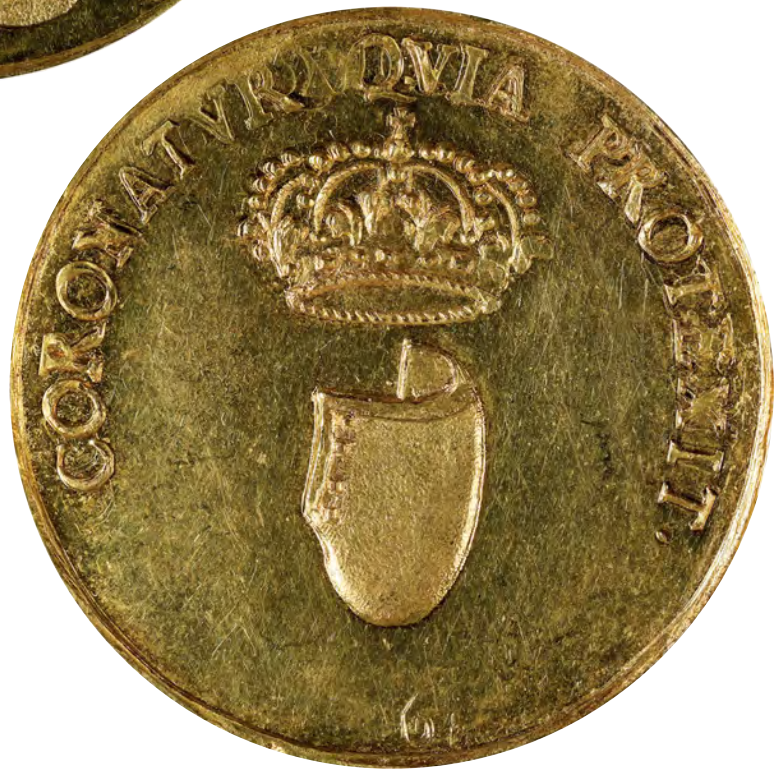
GOLD MEDALLIC 6 DUCATS, ND (1676). JOHN III SOBIESKI. PCGS MS-62.