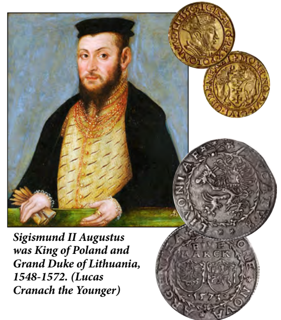
Sigismund II Augustus was King of Poland and Grand Duke of Lithuania, 1548-1572. (Lucas Cranach the Younger)