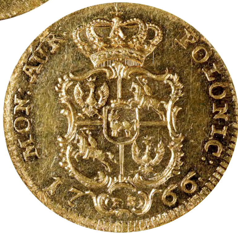
DUCAT, 1766-FS. WARSAW MINT. STANISLAUS AUGUSTUS. PCGS MS-62.