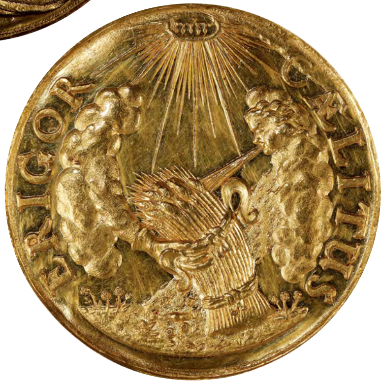
GOLD MEDALLIC 6 DUCATS, ND (1657). JOHN CASIMIR. PCGS UNC. DETAILS.