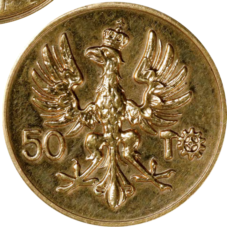
SECOND POLISH REPUBLIC. GOLD 50 MAREK PATTERN, 1923. WARSAW MINT. PCGS SPECIMEN-63.