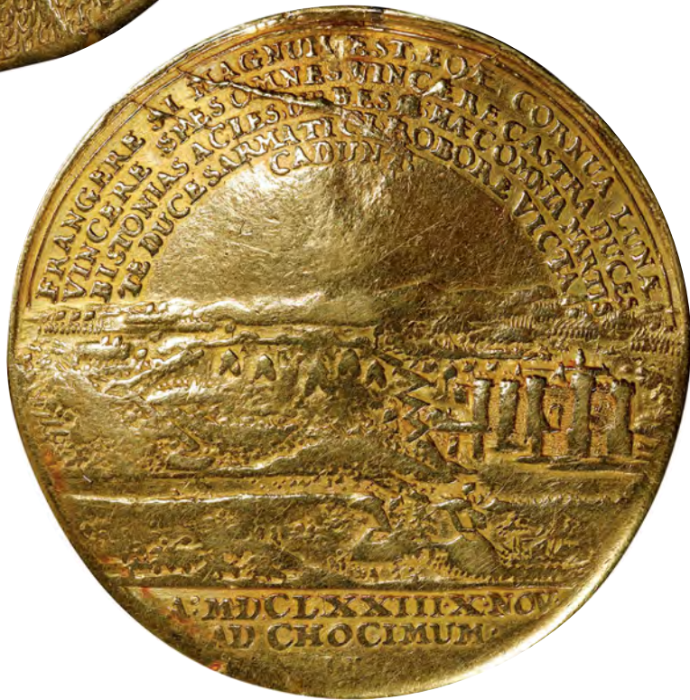
GOLD MEDALLIC 10 DUCATS, 1673. JOHN SOBIESKI. PCGS EF DETAILS.