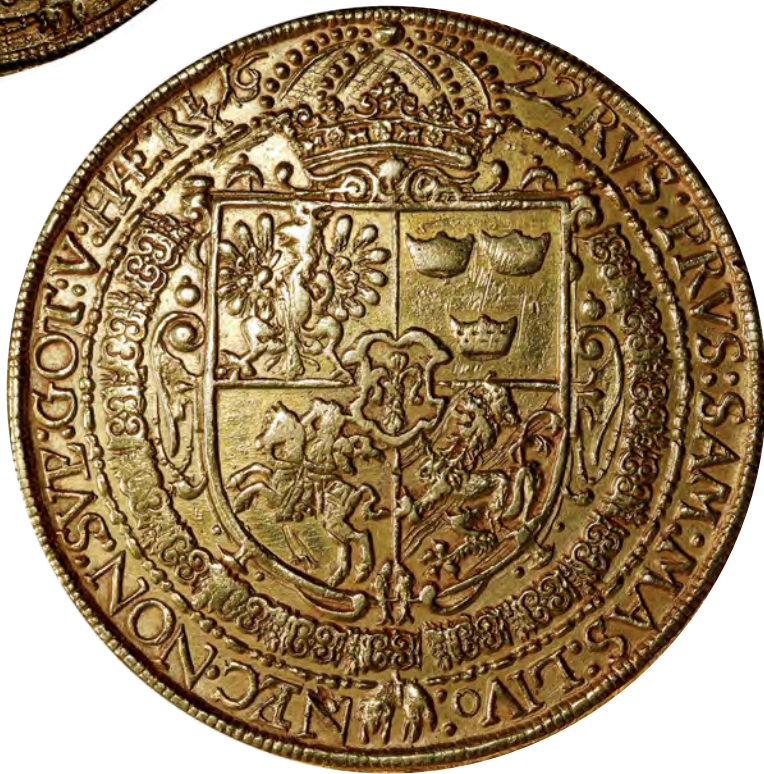
LITHUANIA. 10 DUCATS, 1622. VILNIUS MINT. SIGISMUND III. PCGS AU DETAILS.