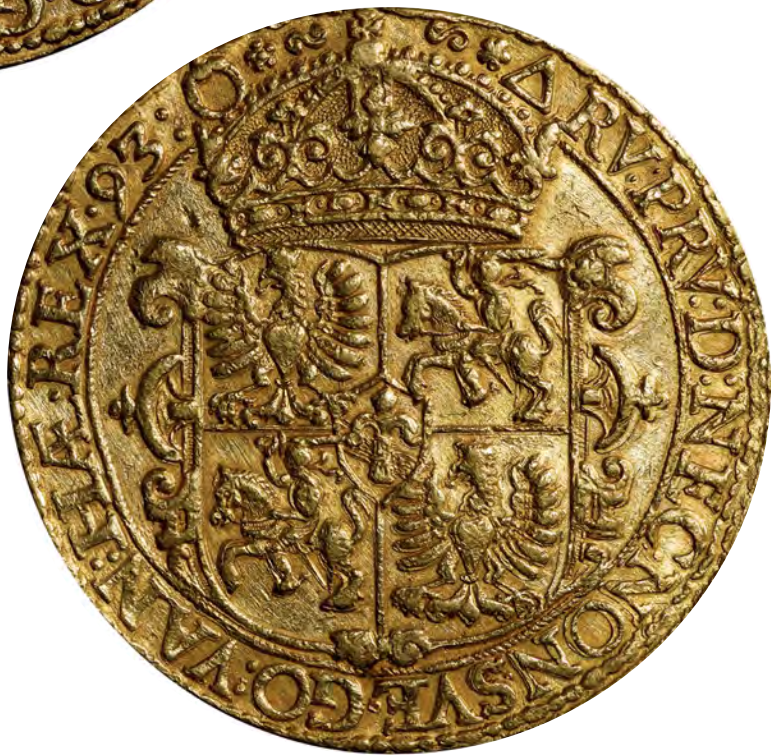
ROYAL PRUSSIA. 10 DUCATS, (15)93. MALBORK MINT. SIGISMUND III. PCGS AU DETAILS.