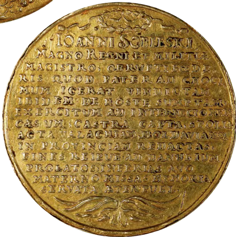
GOLD MEDALLIC 12 DUCATS, ND (1673). JOHN SOBIESKI. PCGS AU DETAILS.