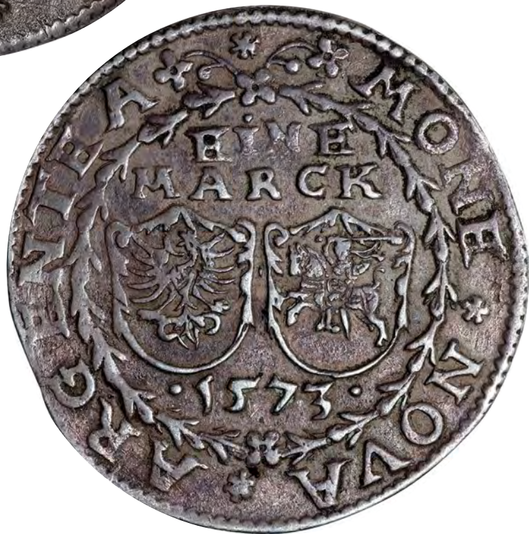
LIVONIA. MARCK, 1573. LATVIA (DAHLHOLM CASTLE) MINT. SIGISMUND II AUGUSTUS. PCGS EF-45.