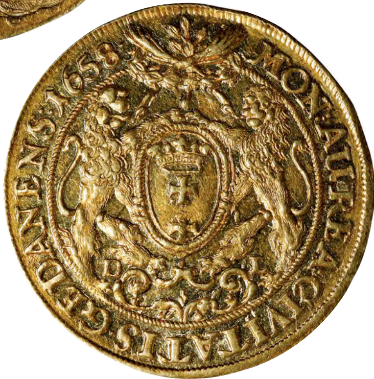
2 DUCATS, 1658-D L. DANZIG MINT. JOHN CASIMIR. PCGS MS-62.