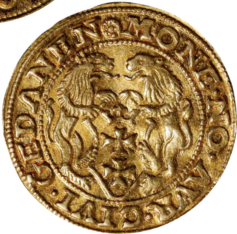
DANZIG. DUCAT, 1548. DANZIG MINT. SIGISMUND I. NGC AU-58.