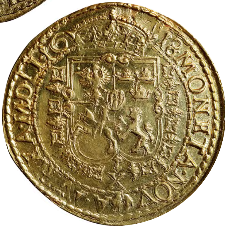
LITHUANIA. 10 DUCATS, 1618. VILNIUS MINT. SIGISMUND III. PCGS AU DETAILS.