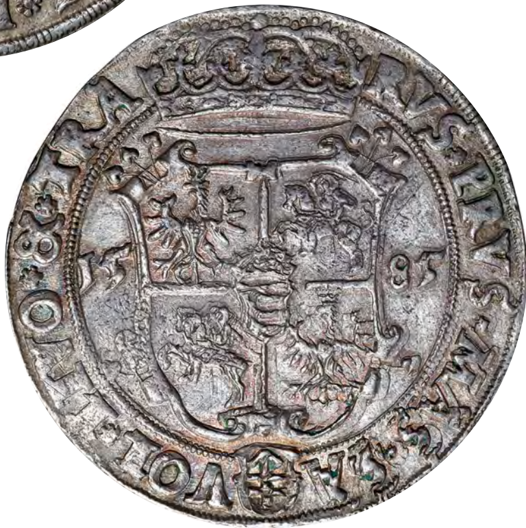
LITHUANIA. TALER, 1585. VILNIUS MINT. STEPHAN BATHORI. PCGS AU-53.