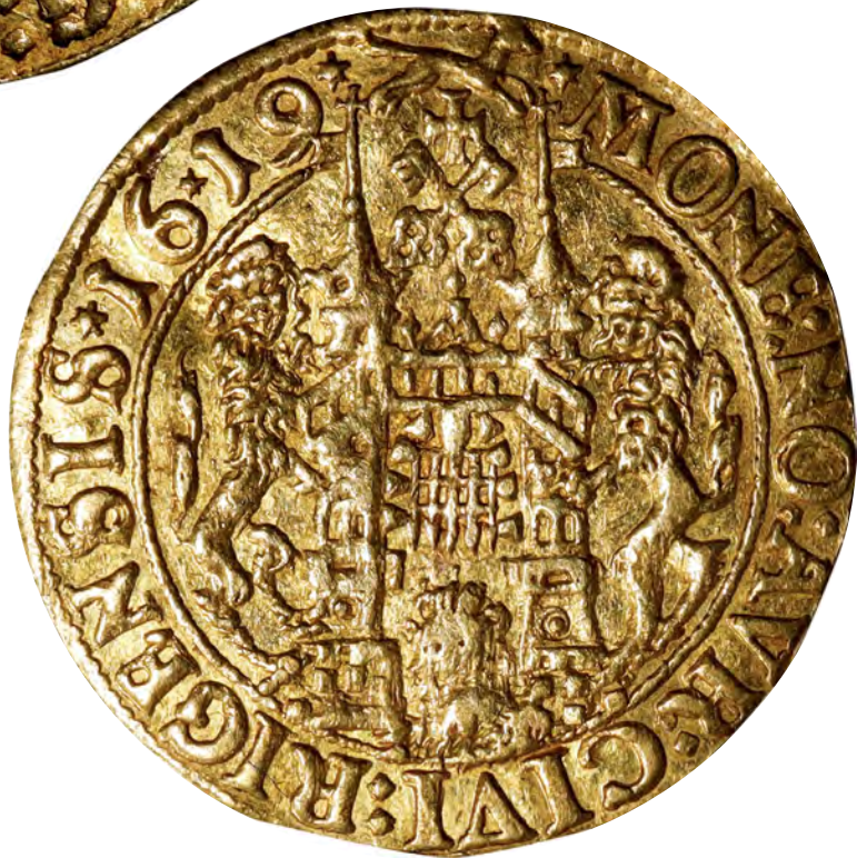
LIVONIA. DUCAT, 1619. RIGA MINT. SIGISMUND III. PCGS AU-58.