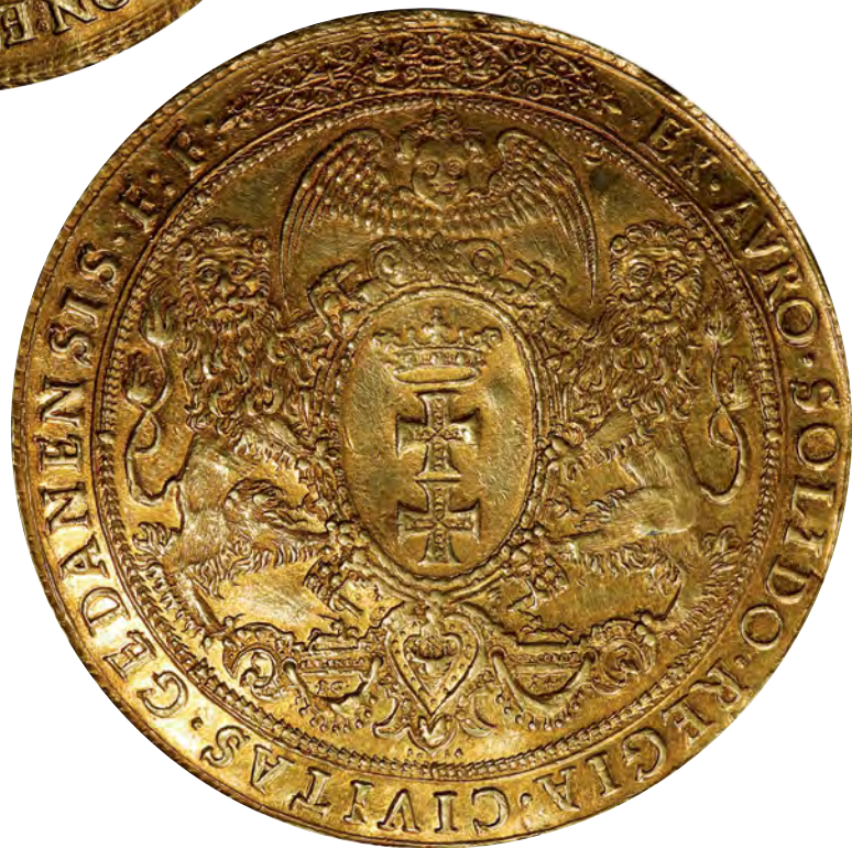
DANZIG. DONATIVE 10 DUCATS, 1613/1614-S A. DANZIG MINT. SIGISMUND III. PCGS AU-55.