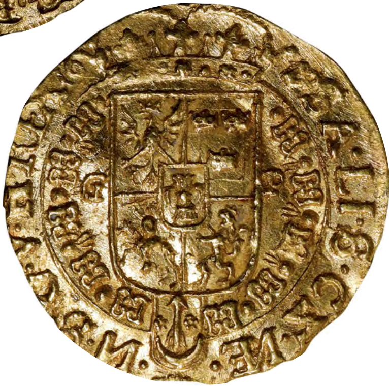
DUCAT, 1649-G P. KRAKOW MINT. JOHN CASIMIR. PCGS MS-62.