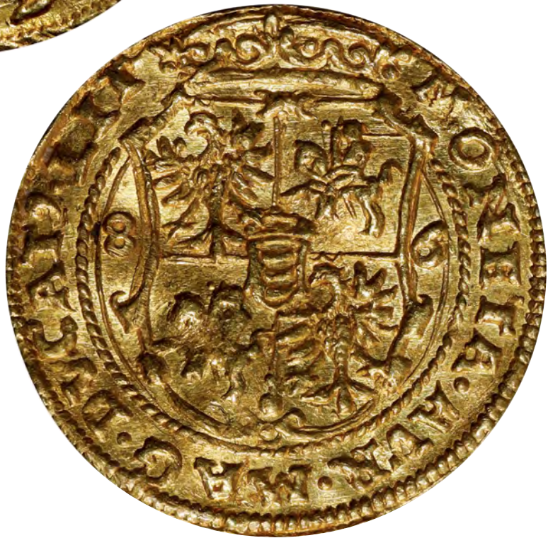
LITHUANIA. DUCAT, (15)86. VILNIUS MINT. STEPHAN BATHORI. PCGS MS-62.