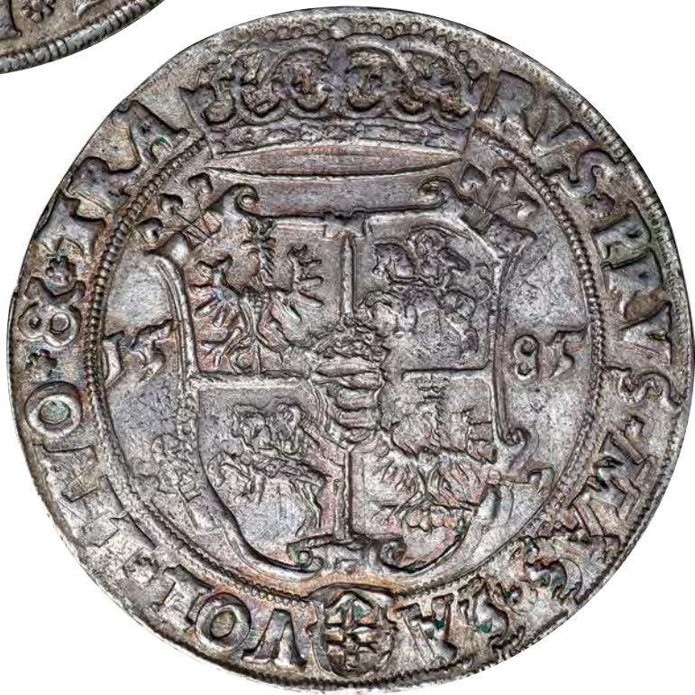
LITHUANIA. TALER, 1585. VILNIUS MINT. STEPHAN BATHORI. PCGS AU-53.