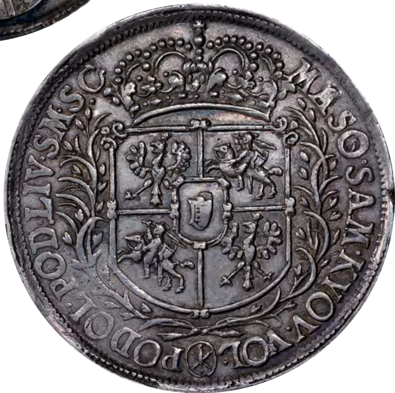
TALER, ND (1684)-SVP. BYDGOSZCZ MINT. JOHN III SOBIESKI. PCGS AU-58.