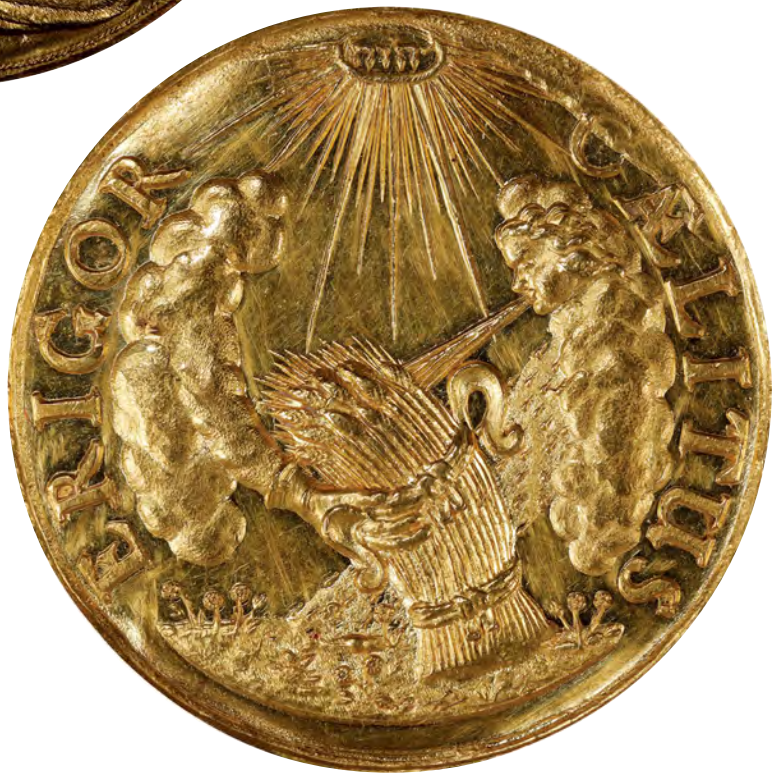
GOLD MEDALLIC 6 DUCATS, ND (1657). JOHN CASIMIR. PCGS UNC. DETAILS.