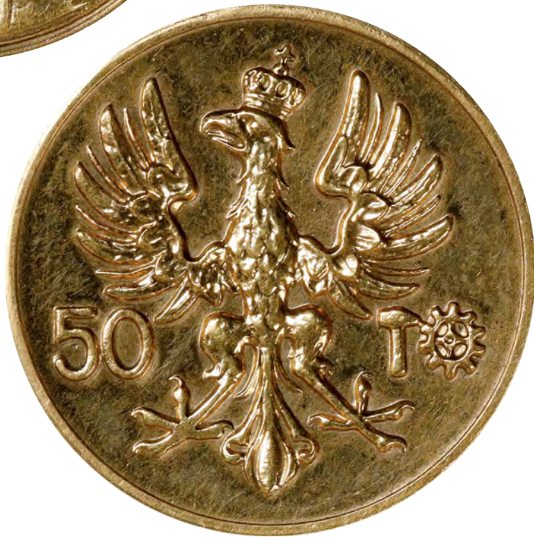
SECOND POLISH REPUBLIC. GOLD 50 MAREK PATTERN, 1923. WARSAW MINT. PCGS SPECIMEN-63.