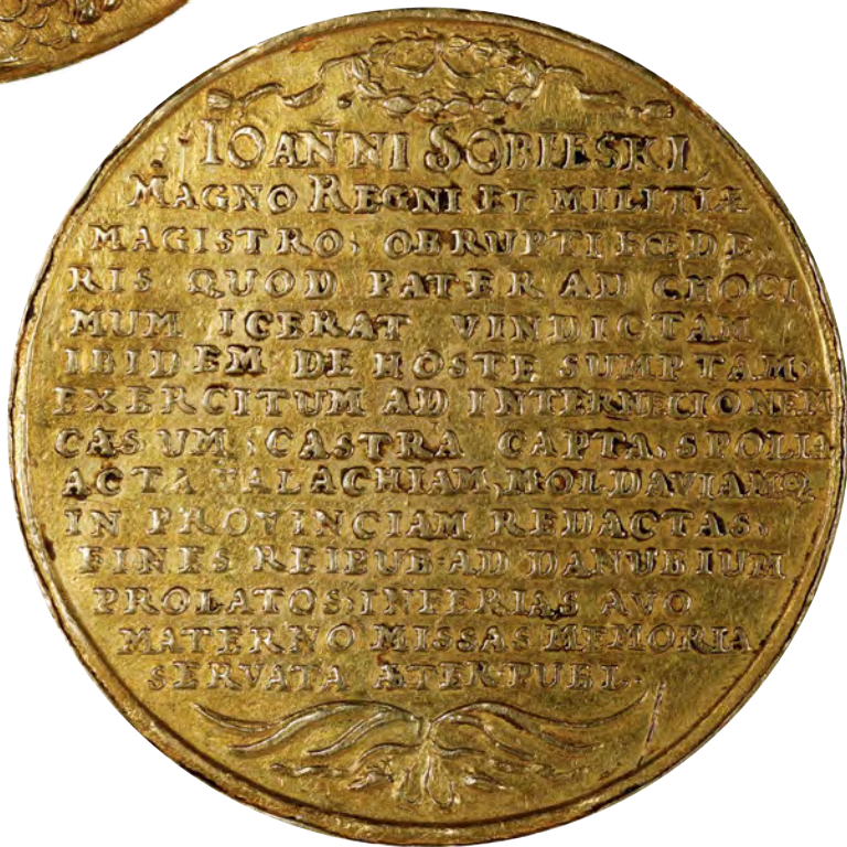
GOLD MEDALLIC 12 DUCATS, ND (1673). JOHN SOBIESKI. PCGS AU DETAILS.