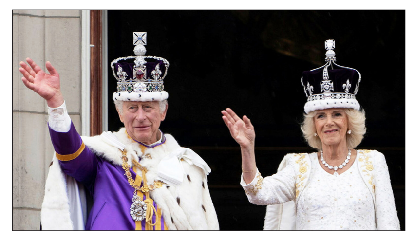
King Charles III and Queen Camilla on the Buckingham Palace balcony following their coronation on May 6, 2023.

zation dedicated to supporting young people in education, training, and employment. Additionally, he has been an active supporter of environmental conservation and sustainable development, founding The Prince's Rainforests Project in 2007. Even prior to his ascension on September 8, 2022, King Charles III had taken on various official duties and roles on behalf of the British monarchy. Having been heir apparent since the age of three, King Charles III is now the oldest monarch ever crowned in British history and brings to his sovereignty a lifetime of experience and wisdom to guide Britain into the future.