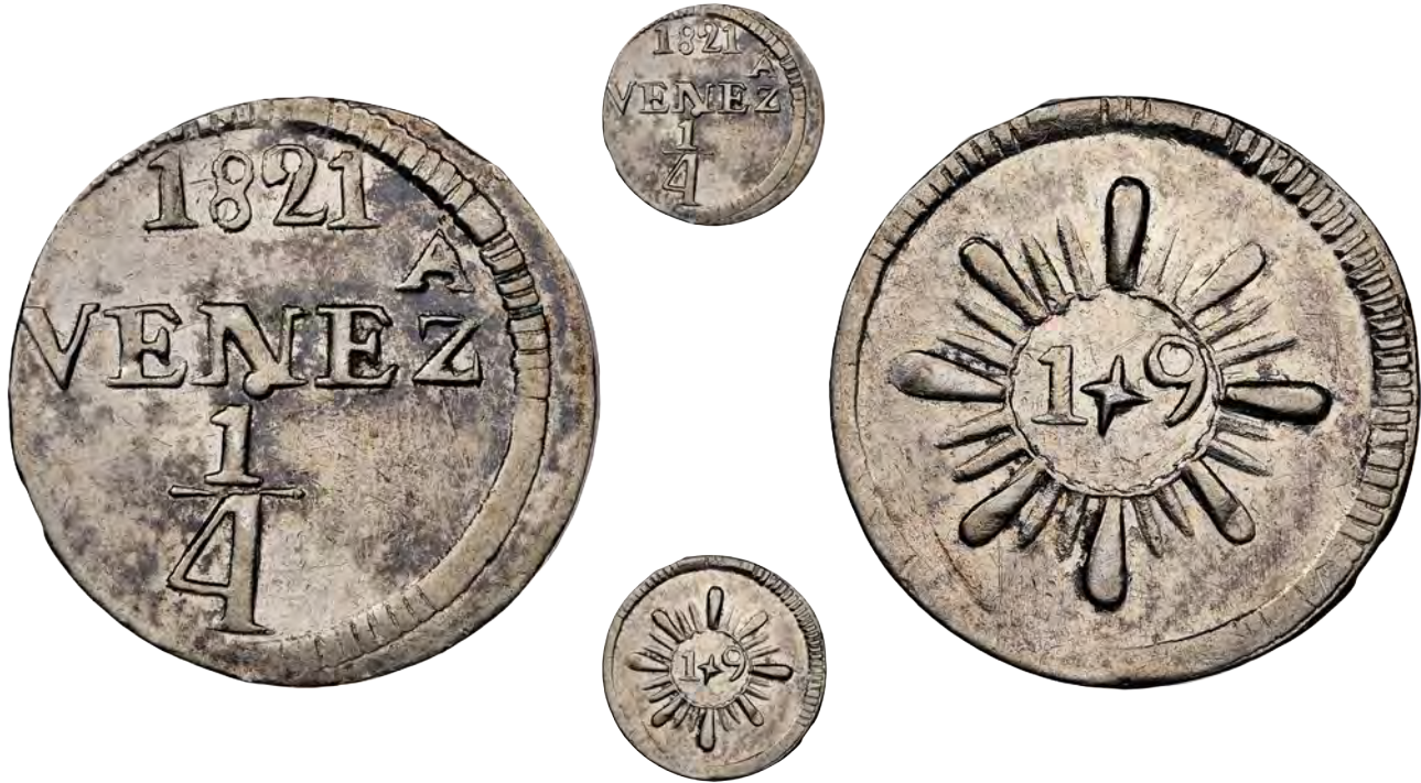
(Smaller image is 2x)