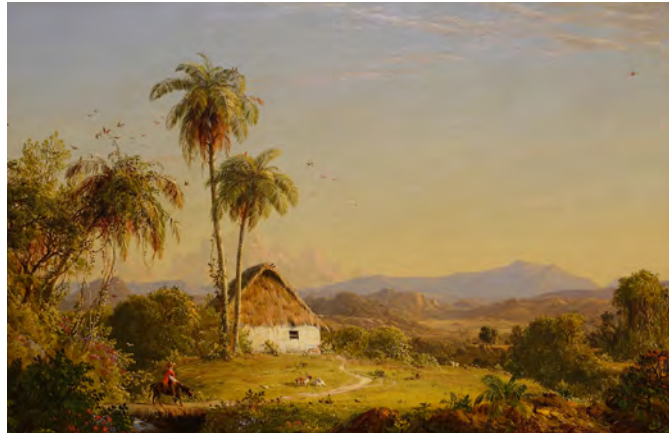
South American Landscape, by Frederic Edwin Church.

opted for a single llama to represent the country on its ¼ Real. The fledgling republics also made copious use of more symbolic imagery, much of it rooted in Pre-Columbian indigenous mythology, that never would have been used during the colonial era. Mexico's eagle perched on a cactus devouring a snake, an important and ancient Aztec symbol, and Argentina's Sol de Mayo sun face, adapted from Incan religious iconography, are two clear illustrations. Notably, both symbols feature centrally on those countries' flags to this day.