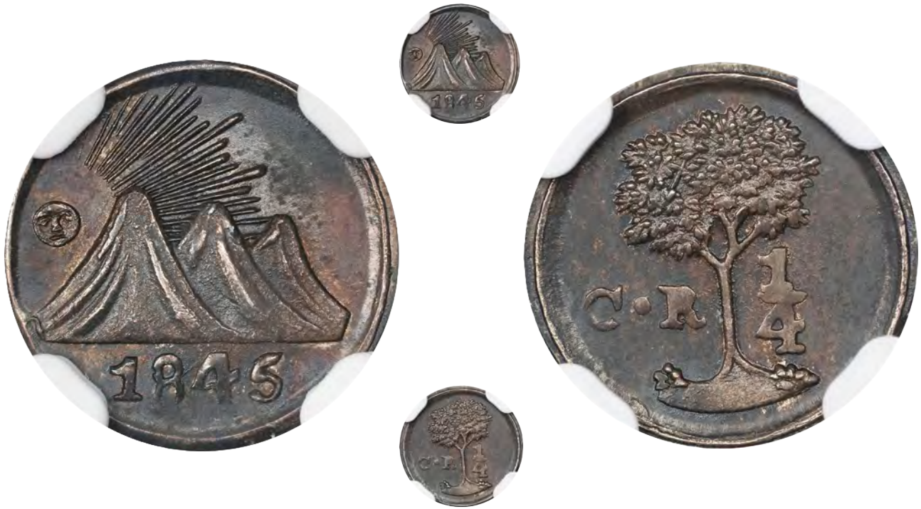
(Smaller image is 2x)