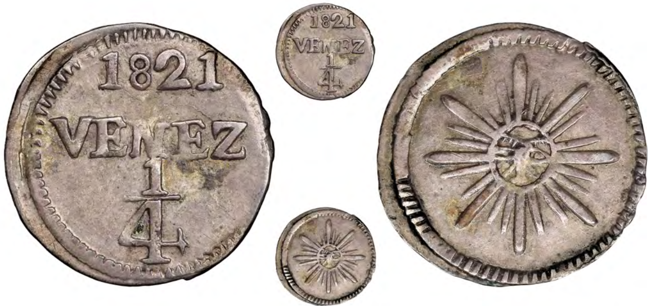
(Smaller image is 2x)