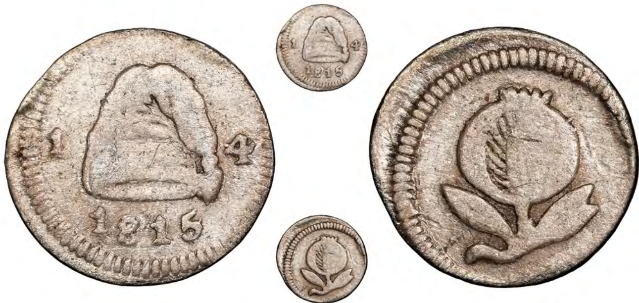
(Smaller image is 2x)