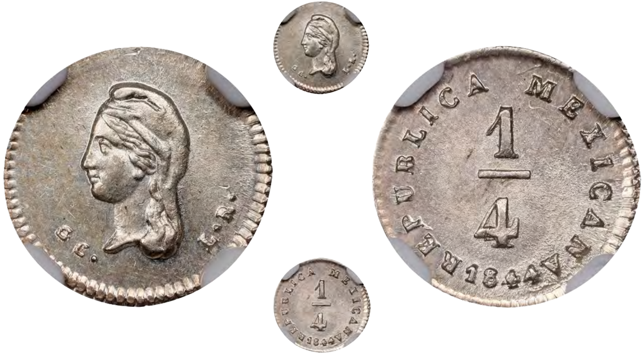
(Smaller image is 2x)