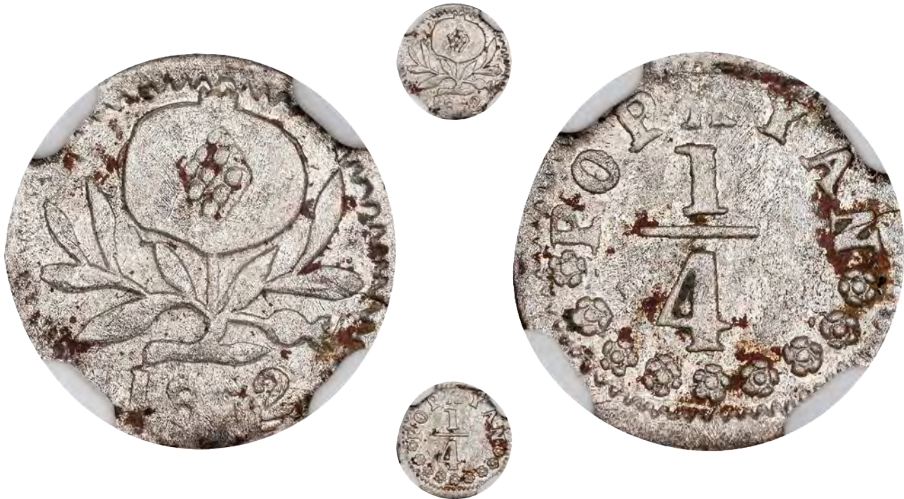
(Smaller image is 2x)