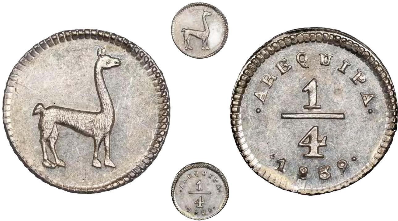
(Smaller image is 2x)