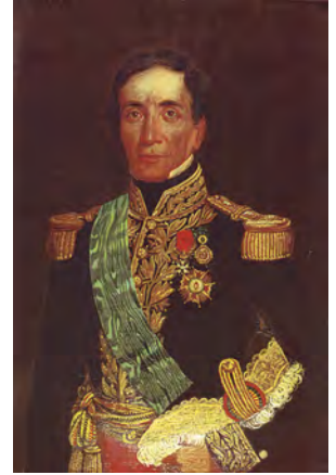
Andrés de Santa Cruz by Manuel Ugalde.

But perhaps more interesting is the use of native flora and fauna that give Latin America's coinage a true sense of place. Miniaturized depictions of the volcanic mountain ranges and ceiba trees of Central America adorn its cuartillos , while Bolivia featured the famed Cerro Rico, renowned for its tremendous silver output. Peru, meanwhile,