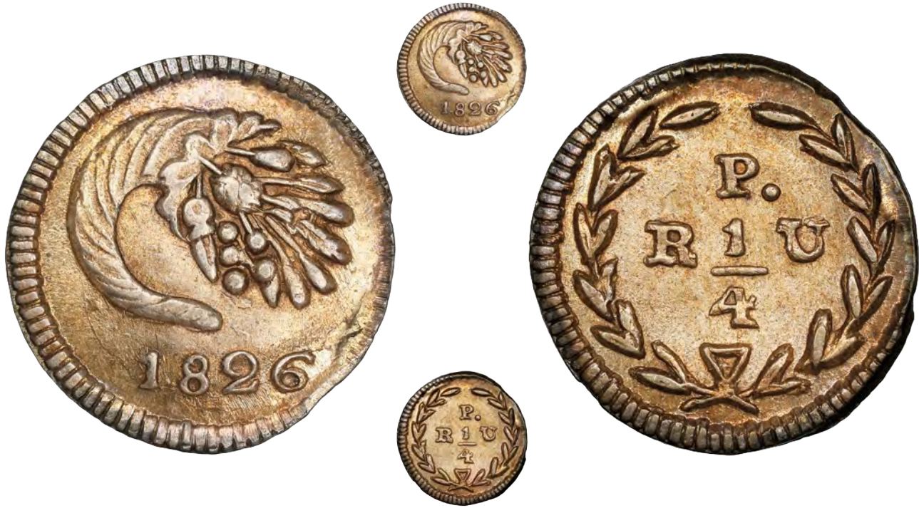
(Smaller image is 2x)