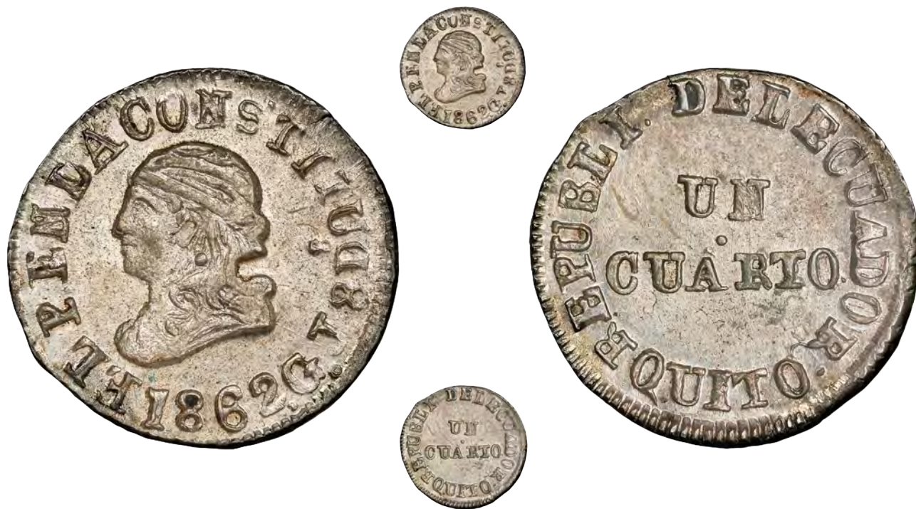
(Smaller image is 2x)