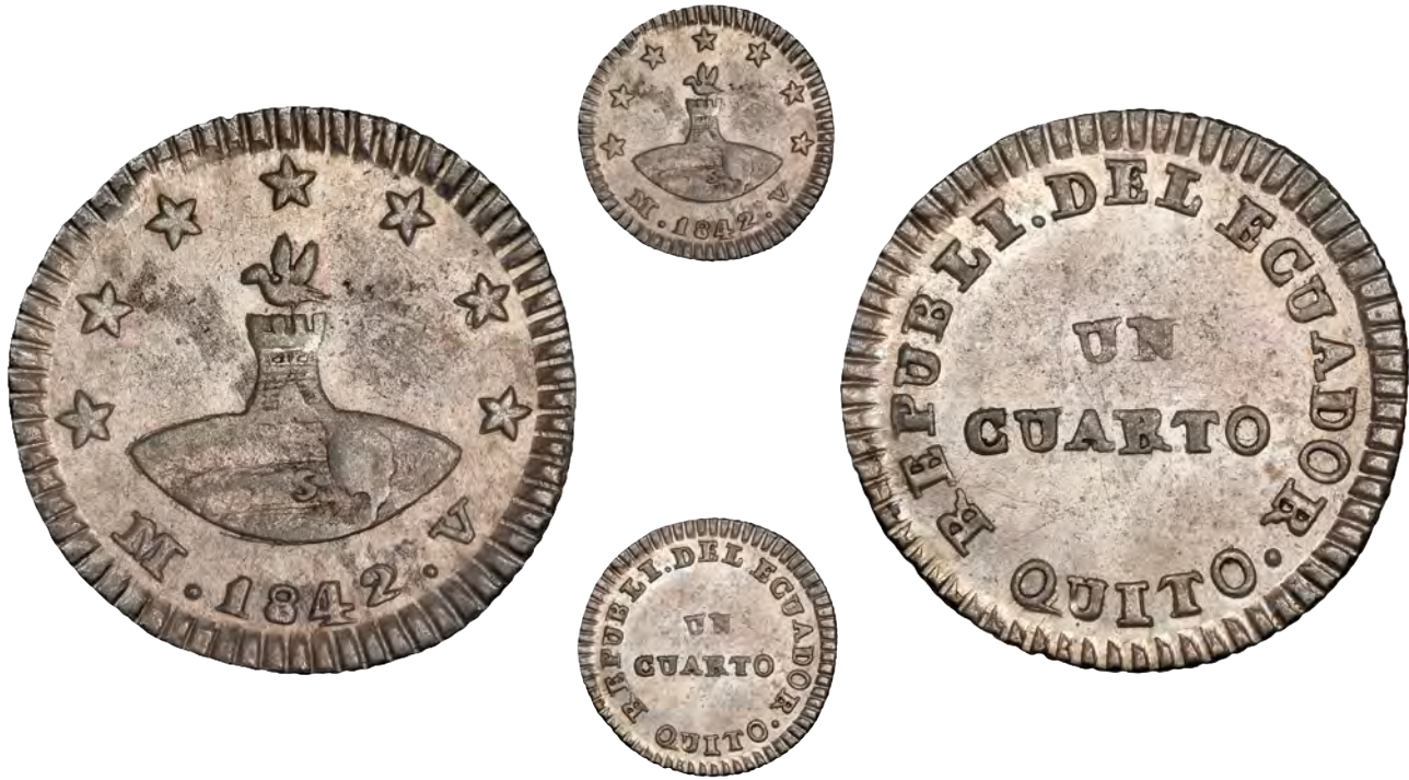
(Smaller image is 2x)