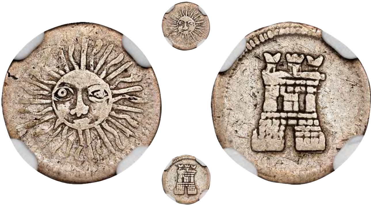
(Smaller image is 2x)