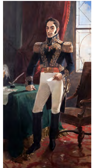
Simón Bolívar by Arturo Michelena.