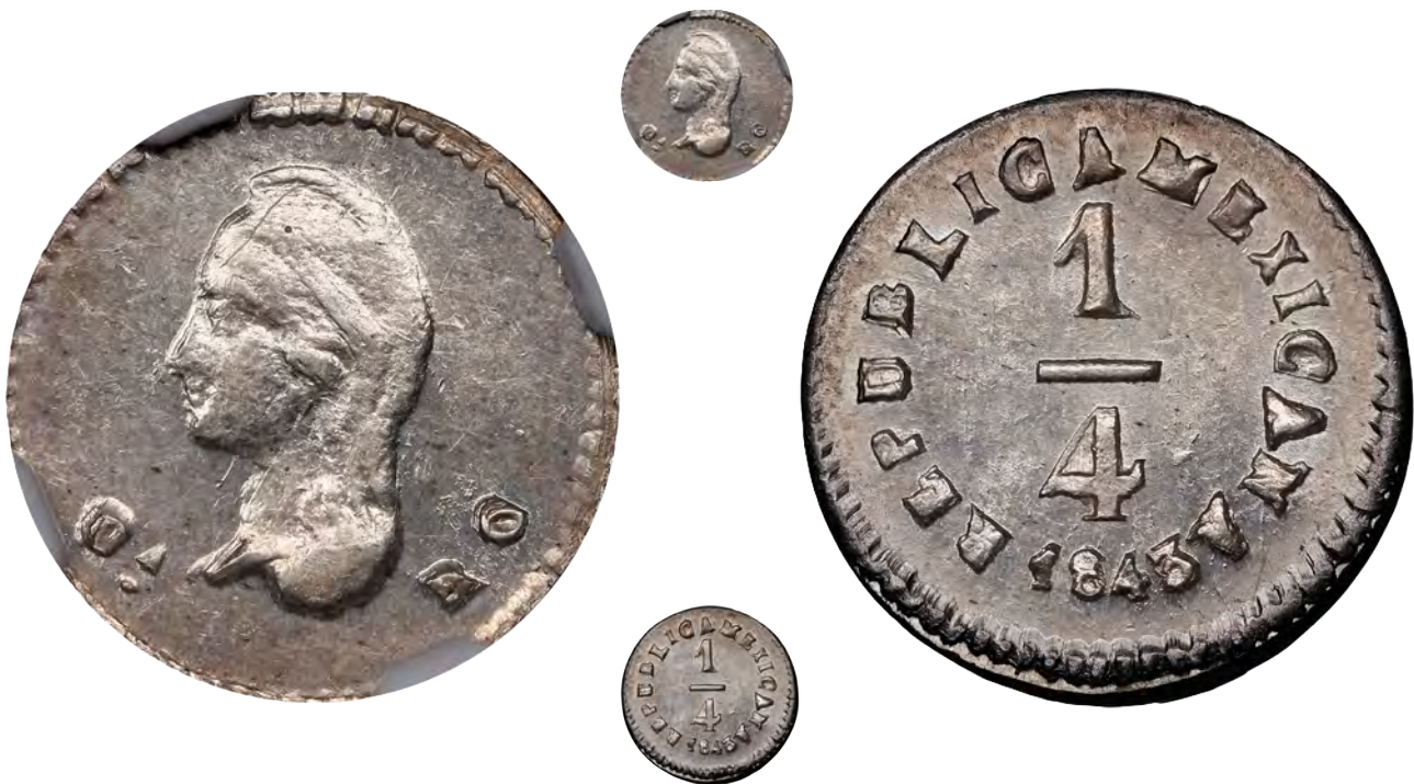
(Smaller image is 2x)