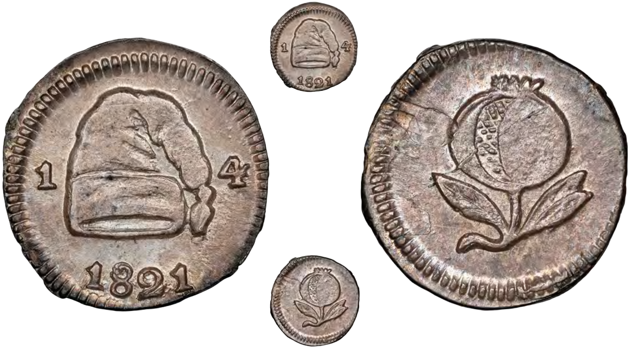
(Smaller image is 2x)