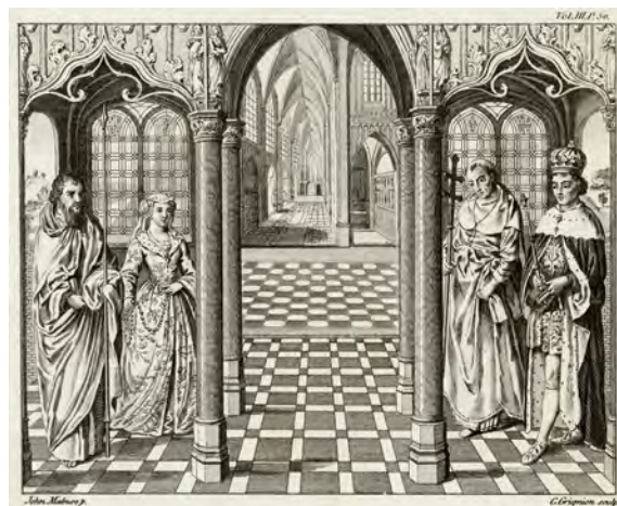
The Marriage of Henry VII and Elizabeth of York.