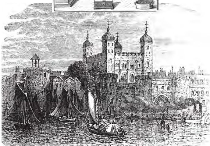
The Tower of London