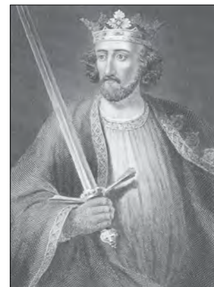
King Edward I