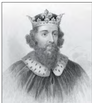
Alfred the Great